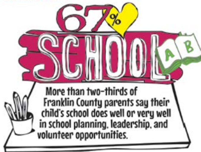
Figure 2: Parents' View of School Engagement