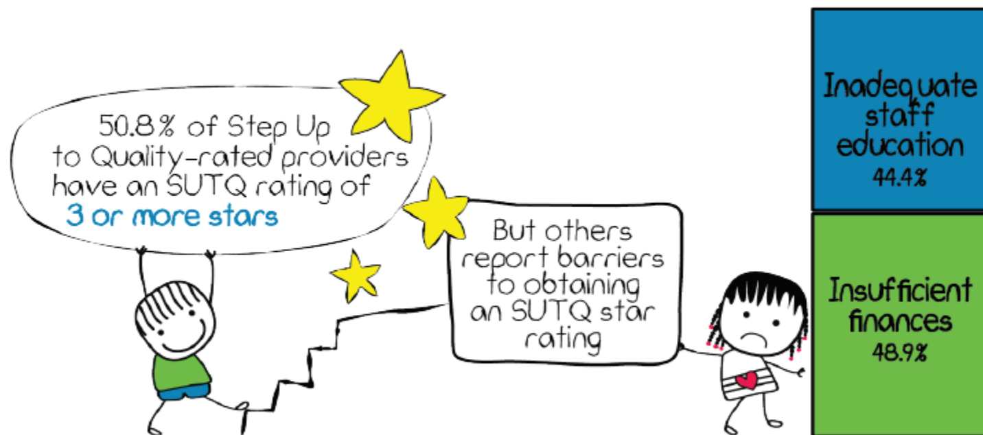
Figure 5: Quality ratings and Barriers for SUTQ-Rated Provider Survey Respondents